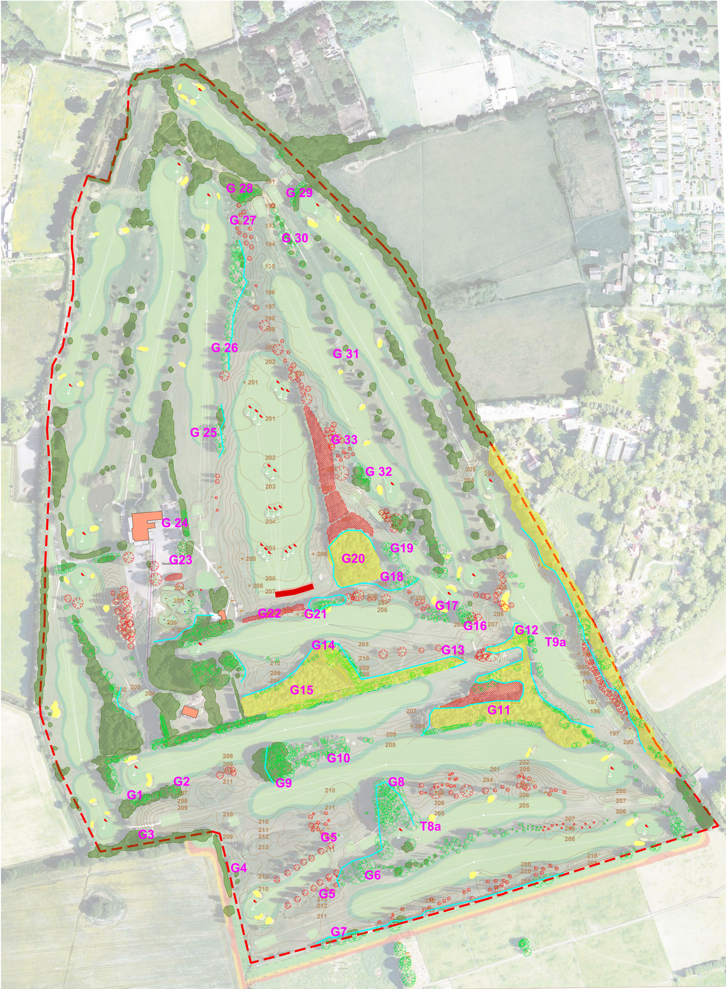
CLGC - Site Clearance Plan - 100.10 (Rev C)